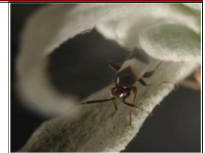
Image: New species Ausejanus tiramisu Menard and Schuh from coastal Australia, on its host-plant Olearia axillaris

Katrina Menard (Sam Noble Museum) recently described 20 new species of plant-bugs (Heteroptera: Miridae) from Papua New Guinea, Australia and the Solomon Islands. Menard's co-authored work was published in the Bulletin of the American Museum of Natural History in November 2011.